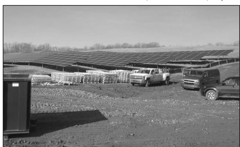
SOLAR FARM: Delaware River Solar, Inc. recently completed installation of New York State's largest community solar project on Baer Road in the hamlet of Callicoon. The 2.7 MW solar array has approximately 9,800 panels and will reportedly supply energy to more than 350 homes and businesses. It is located just outside the designated boundary of the Upper Delaware Scenic and Recreational River in the Town of Delaware.