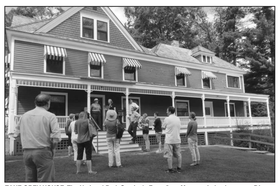
ZANE GREY HOUSE: The National Park Service's Zane Grey Museum in Lackawaxen, PA was a tour stop for an Upper Delaware orientation for elected officials and policy makers in August 2016 organized by the National Parks Conservation Association and Friends of the Upper Delaware River. The museum will transition into a visitor center.