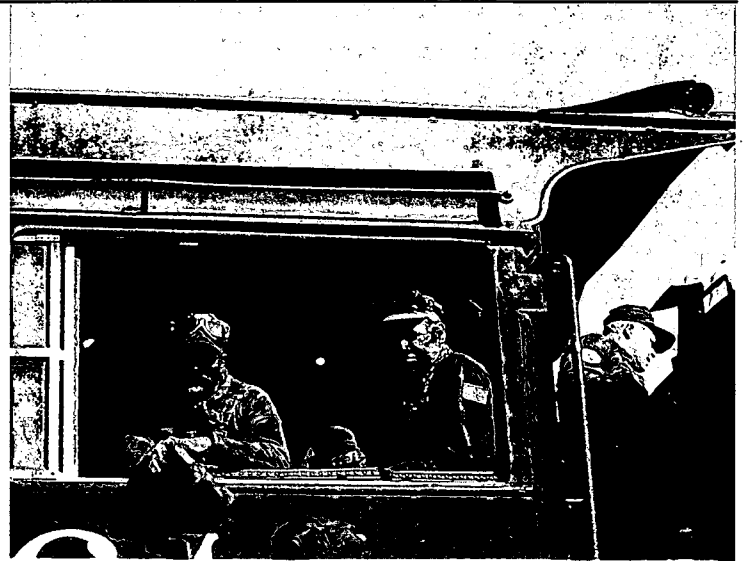
It was all aboard for an old-fashioned steam train excursion as Chesapeake & Ohio Engine No. 614 chugged into Port Jervis, NY October 11 for the city's Annual Fall Foliage Festival. The 434-ton steam train, operated by Iron Horse Enterprises of Lebanon, NJ, made the 175-mile round-trip to raise funds for the New Jersey Railroad and Transportation Museum and introduce its 1,200 passengers to local attractions like the Erie Depot, Fort Decker, and Gillinder Glass Museum. Once in Port Jervis, the soot-faced locomotive engineers, pictured above, took advantage of the restored, electric Erie turntable before heading home following their afternoon of sightseeing and leisure. Engine No. 614 is believed to be the last passenger steam locomotive built in America. Future weekend passenger excursions to Port Jervis are expected.