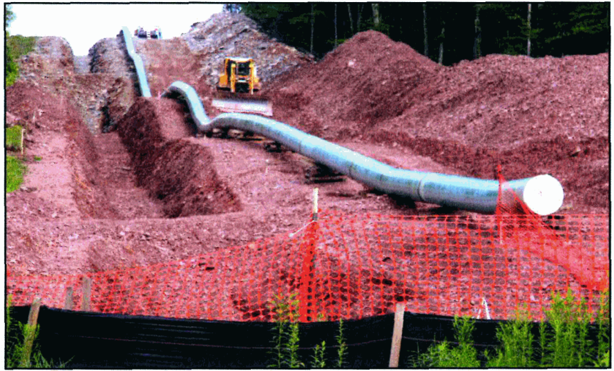
LAYING PIPE: The Tennessee Gas Pipeline Co. was laboring in Wayne and Pike Counties all summer installing new parallel line and pressure stations as part of its 300 Line Expansion Project to transport natural gas through northeastern Pennsylvania. This pipe section above was being prepared at a site off Rt. 652 between Beach Lake and Honesdale in early August.

New York State will accept public comments through Dec. 12 on its revised draft Supplemental Generic Environmental Impact Statement (SGEIS) that was released in sections on July 8 and Sept. 7.