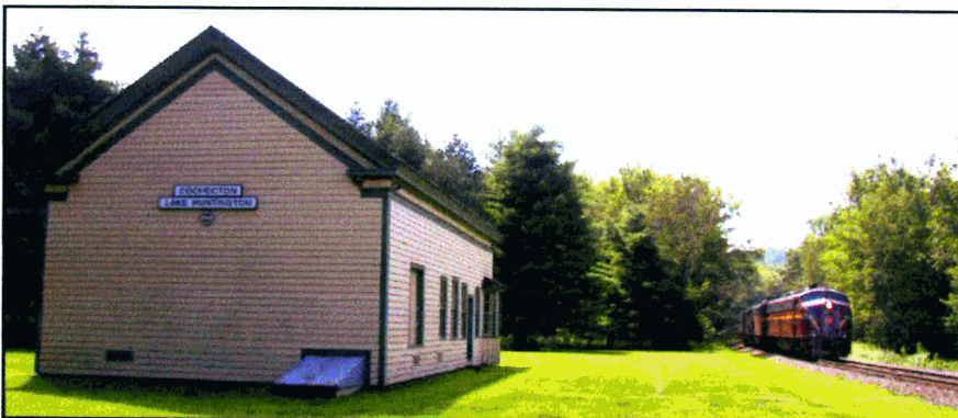
DAYS OF YORE: Regular passenger train service through the Upper Delaware River Valley ceased in the 1960s, but on Aug. 5, the Norfolk Southern Railroad tracks carried a special excursion by a circa-1950 EMD E8 diesel locomotive pulling eight passenger cars. The train traced the route of the old Erie mainline from Hoboken, NJ to Youngstown, OH. Above, the 2,250-horsepower locomotive painted in authentic Pennsylvania Railroad colors passes by the 1850s-era Cochetcon Station, considered the oldest surviving railroad depot in New York State. Railroad buffs were out in force to document the journey.

On April 7, the UDC sent a letter to the Delaware River Basin Commission strongly supporting the implementation of the release recommendations for coldwater ecosystem protection improvements from the White Paper produced by the New York