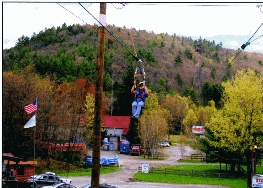
TWO-MILE THRILL: Riders on Kittatinny's zip line can reach upwards of 50 miles per hour. At its highest point, riders are nearly 150 feet off the ground on their 3,000 foot, 36-story descent. With ropes to hold on to, riders can steer themselves on the way down to stay straight.

With redundant safety systems on both the harness and braking systems, the zip