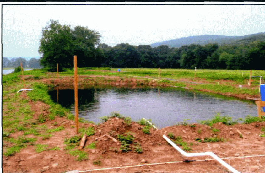
ILLEGAL FISH FARM: The New York State Department of Environmental Conservation ordered an allegedly unpermitted tilapia fish hatchery discovered by National Park Service rangers on Big Island two miles south of Callicoon, NY to shut down following a July 29 inspection. Lewis Wu of Spring Valley, NY received a Notice of Violation from the DEC on Aug. 1 that required him to dismantle the operation that consisted of monofilament-covered, manufactured ponds, piping, and compressor stations to pump Delaware River water; dispose of the fish; and remediate the site to its original condition. The investigation continues and federal charges may be pending.

"The Delaware River has an irreplaceable role in this nation's past and present - whether it can have a healthy and contributing role in our future will be determined by the actions and decisions of today," commented Maya van Rossum of the Delaware Riverkeeper. ❖